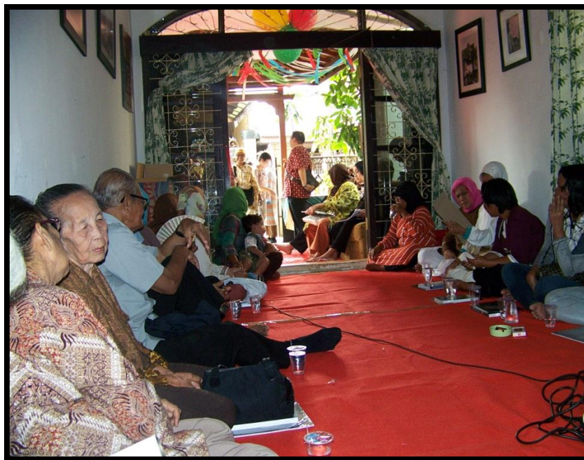
Timor Leste: HAK Association