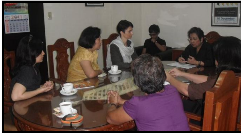
Actual Commemoration of the International Week (IWD) of the Disappeared