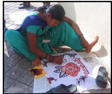
A young Nepali girl paints her sadness and grief on a white cloth.

Organizations which were ready for such level of activity chose from among those who participated in the national rehabilitation sessions, "Healing Wounds, Mending Scars" potential healers of their co-victims. Thus, the third level of rehabilitation program conducted by AFAD was implemented by the following: