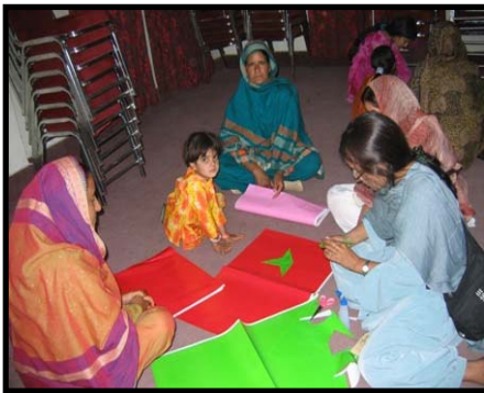
Families in Pakistan remember their disappeared loved ones through art.