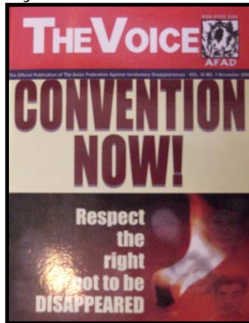
AFAD distributes copies of "The Voice" calling for the approval of the Convention.

To note, the office of the not very efficient in informing NGO applicants applications. In the next November during the Convention, the resent followed up, because acknowledgement of written requests for informed that no said When the AFAD requested them to retrieve application was found.