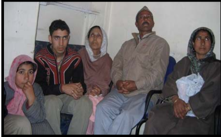
Kashmiri families demand: Stop disappearances!

The three-day activity was done through individual sharing to the whole group of about 25 family members of the disappeared and one-on-one sharing of the effects of the disappearance by each of the participant present.