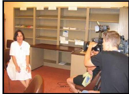
BBC interview in Geneva during the first HRC session.

A Parallel Activity, jointly conducted by AFAD, FEDEFAM , We Remember-Balarus and International Commission of Jurists, Linking Solidarity was conducted while the official session was on-going in June 2006. The presentations of the Panel of Speakers focused on the Draft Convention on the Protection of All Persons from Enforced or Involuntary Disappearances.