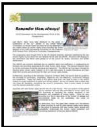
A copy of the IWD statement.

During important occasions in the Federation's calendar such as the International Week of the Disappeared and the International Day of the Disappeared, or even on significant news events, i.e. the struggle against the King in Nepal last April, AFAD came out with statements to express solidarity with its member-organization and also to make known to the public AFAD's stand on occurring events and controversial issues.