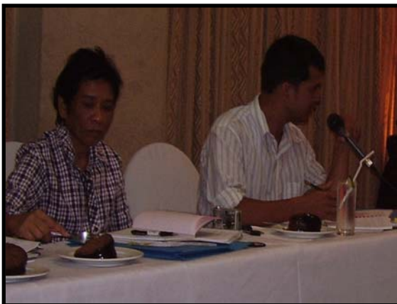
Training participants listen attentively.

to bring truth and justice not only to the many cases of disappearance in Asia but also threats to the lives of families of the disappeared. Ms. Citroni highlighted two important points as to why it is crucial to use these mechanisms: "1) because sometimes they are effective; and 2) because international awareness on what is going on in Asia is important."