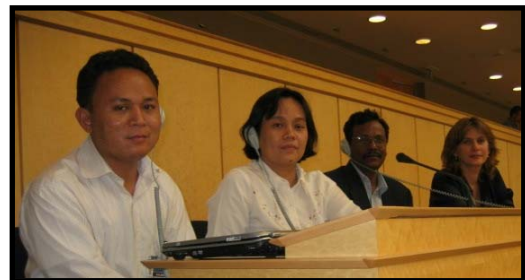
AFAD members attend the HRC session in Geneva.

For the future international treaty to enter into force, it has to be ratified by at least twenty-member states of the United Nations. If these member-states will ratify, they will be obliged to codify the specific offense of enforced or involuntary disappearance in their penal code. Thus, national laws criminalizing enforced or involuntary disappearances have to be enacted by UN member-states that ratify this international treaty.