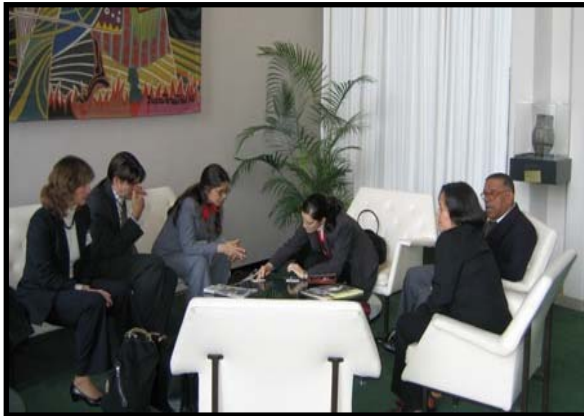
Strategizing during the assembly in New York.

In October 2006, during the on-going session of the United Nations General Assembly, AFAD cooperated with FEDEFAM , We Remember-Belarus, the Center for Victims of Trauma in South Africa and Linking Solidarity in their last ditch efforts to continue lobbying, at a very late stage, for the final adoption of the Convention.