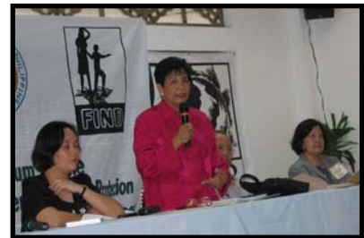
CHR Commissioner Purificacion Quisumbing addresses the audience composed of representatives from the police, military, NGOs and the CHR.

In cooperation with the Philippine Commission on Human Rights and FIND, AFAD co-organized a third forum on the Convention on the Protection of All Persons from Enforced or Involuntary Disappearances. The purpose of the Forum was to ensure a positive vote of the Philippine Government during the United Nations Convention on the Protection of All Persons from Enforced or