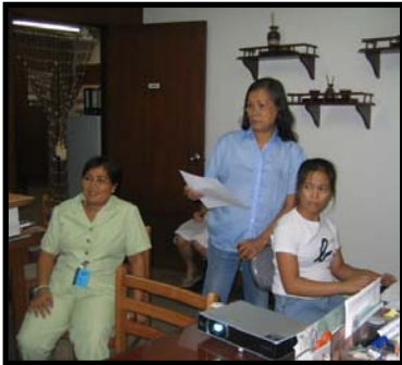
Workshop on filing finance requests.