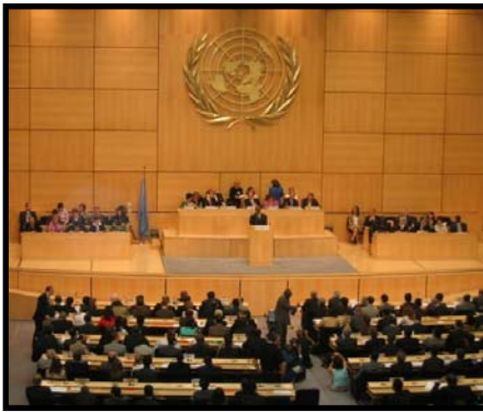
First session of the Human Rights Council in June 2006.

AFAD's International Lobby work within the period was centered on the adoption of the United Nations Draft Convention on the Protection of All Persons from Enforced or Involuntary Disappearances by the United Nations Human Rights Council. It is important to note that in March 2006, the then United Nations Commission on Human Rights was abolished. Immediately after its abolition, the United Nations established its Human Rights Council which is composed of forty-seven UN member-states, 13 of which are Asian governments. In its historic first session attended by the AFAD delegation, the United Nations Human Rights Council unanimously adopted the United Nations Draft Convention on