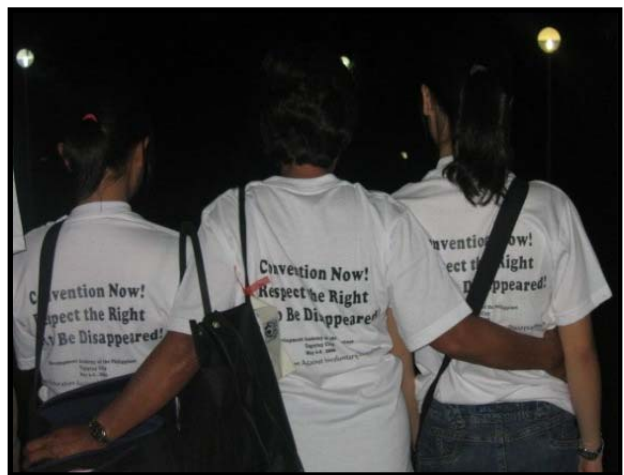
Secretariat members sport their Convention Now! campaign t-shirts.

In the aspect of lobbying, AFAD claims its modest contribution to the unanimous adoption of the Convention on the Protection of All Persons from Enforced or Involuntary Disappearances by the United Nations Human Rights Council in Geneva, the Third Committee of the United Nations General Assembly in New York. Its consistent and active participation in all sessions of the then Inter-Sessional Open-ended Working Group to Draft a Legally-Binding Normative Instrument for the Protection of