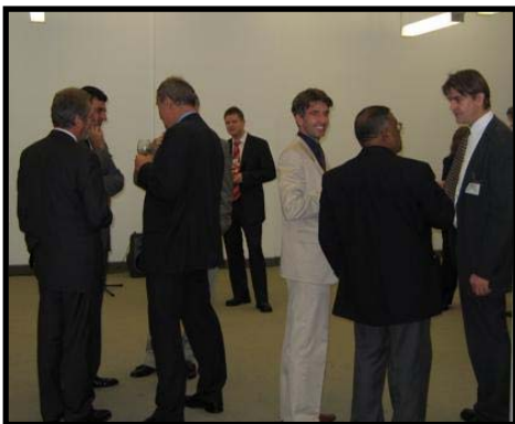
With Linking Solidarity partners in New York.

AFAD sustains its relationship with its partners through regular reporting and writing of project proposals to possible new partners. If there were opportunities for personal visits in their respective offices, the AFAD Secretary General visited them, e.g. HIVOS – The Netherlands and the United Nations Voluntary Fund for Victims of Torture in Switzerland.