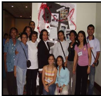
AFAD Secretariat and friends pose in front of the Desaparecidos exhibit at Rockwell Center.