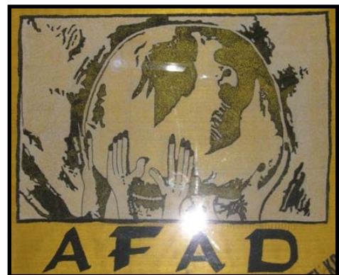
Embroidered AFAD logo – framed and displayed at the Secretariat office in Manila, Philippines.

On the whole, AFAD, hand in hand with the rest of the international movement against disappearances, is gradually moving forward in its uphill struggle for a continent, nay a world without desaparecidos . In the course of doing this, not only is its solidarity work among similar formations in other parts of the work important.