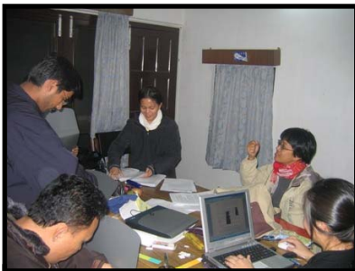
Working at the Advocacy Forum Office. (above)